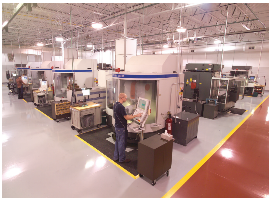
End Mill Manufacturing